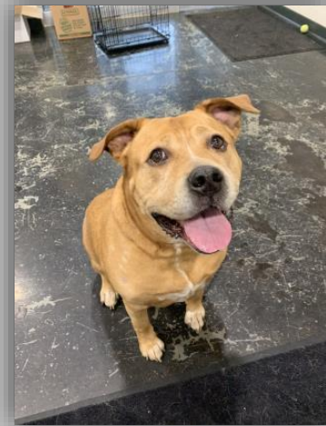
Sweet Sully is adoptable! Please refer a friend.